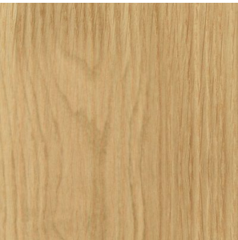
OILED SOLID OAK