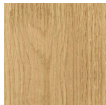
OILED SOLID OAK